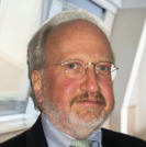
Stu Lawrence Sibson Consulting, USA